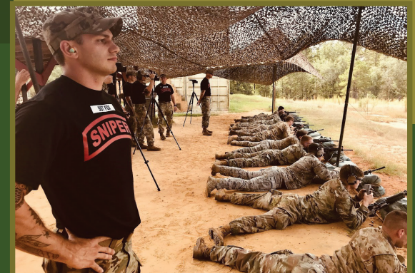
Photographic permission has been granted to the County of Oneida by the Fox Family