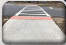
Crosswalks & Sidewalks