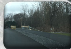
Minimal Verge Side Path

Consideration of homes close to the street is vital Roundabout/Realignment, ped & bike facilities, consideration of freight Sharrows likely ok on Merrick Road today, but what is the future development potential?