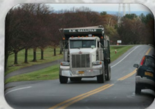
Wide Verge Side Path